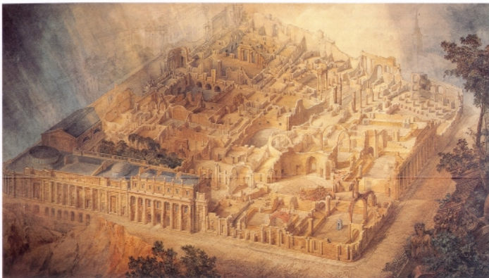
Fig. 9. Joseph Michael Gandy, Soane’s Bank of England as a Ruin, 1830.

What used to be “discommodity” in the antiquarian frame is now being subject to a modern science of error . 24 Thus, even as Soane’s entire professional career at the Bank of England can be said to be premised on this new mathematical imperative, one can see in his covering over the new regulative criterion by recourse to an antiquarian theory of sentiment, a studied aversion to that very body of new knowledge. It is through this riven mix of radical knowledge and ancestral sense that perhaps one should also view Soane’s associate, Joseph-Michael Gandy’s famous renderings of the Bank of England.