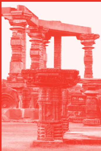
Fig.9 Qila Warangal, Kakatiya Palace Complex, thirteenth century.

Our route would take us through the districts most under Maoist influence: Warangal, Karimnagar, Adilabad. In 2002, Warangal and Karimnagar were two of the three districts in which as many as 2,580 deeply indebted farmers had killed themselves by ingesting pesticides. 13 Our final destination would be Indravelli, site of the 1981 massacre and the Tiananmen-inspired monument, a one-street market town deep in the forested tribal area of Adilabad district, bordering on the neighboring state of Maharashtra.