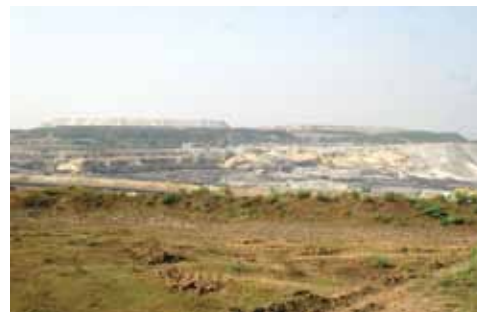
Fig.19 Strip mining, Godavari Khani Coal Fields, Singaneri Collieries, near Bellampalli, Andhra Pradesh.

On the road out of the mining region of Bellampalli, my companions whisper nervously as we pass what they recognize as a death squad, five moustached men in an open, commandeered jeep, weapons kept out of sight, a pot-bellied subinspector riding in front. 21 The road to Indravelli from