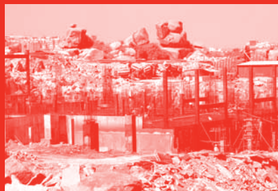
Fig.6 Construction on a BPO Incubator, Hyderabad Cybercity, January 2007.

much-touted BPO services—the cynosure of the international media and of the dominant coterie of “cultural studies” in academia—but in fact through intensified extraction and export of ore, minerals, and petroleum products. This is markedly “old economy” stuff, a return to India’s colonial structure, where the BPO industries more or less serve as globalizing gloss, with the caveat, mutatis mutandis , that Indian firms were now selling the raw material to Chinese firms who were selling manufactured goods to Western consumers, while carrying American debt to hold up the price of the dollar, and so on. Given this chain, it is plausible that the Citigroup report exaggerated the actual danger from the Maoist insurgency to startle stock-market investors, a constituency to which both the neoliberal Congress and its antecedent governments were in consummate thrall. Nonetheless, it was clear that both the Maoist militants and India’s substantial tribal population—politically ignored and brutally exploited—ensconced in the forests and ravines that also hold the bulk of India’s mineral reserves, were now directly in the path of this chain of extraction.