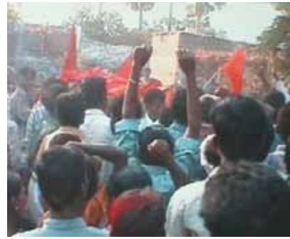
Fig.18 Maoist front organizations inaugurating various new memorials.

draw from credible intelligence. The calculus here is more often than not defined quantitatively rather than qualitatively: A provocation was met with A' response, B Naxalite raid was followed up by B'+ arrests. Cause and effect need not be linked. The police operate in the mode of the "theoretical" pronouncements spouted by academics, drawn out of the compulsions of an internal framework of disciplinary judgment and advancement, of tenurial rewards and promotions within the organization. (To extend the metaphor, the interior ministry produces statements that are akin to those by university deans, full of transcendent truths and universal, imminent "solutions," aimed more at soliciting their financiers.) In the process, to quote Strelnikov from Dr. Zhivago : "A village is burnt, the point is made."