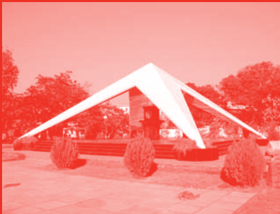
Fig.8 Police memorial to cadre killed by Maoists, Warangal city, Andhra Pradesh.