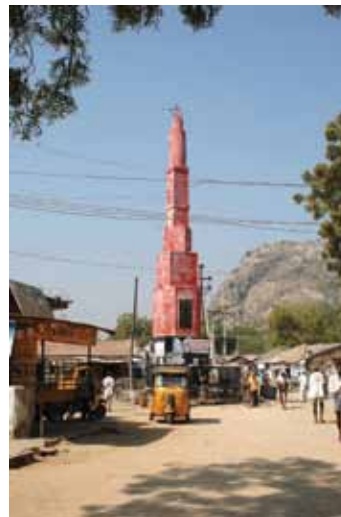
Fig.12 CPI (Maoist) "Martyr's Memorial" to cadre killed by police, Zaffargarh, district Warangal, Andhra Pradesh.