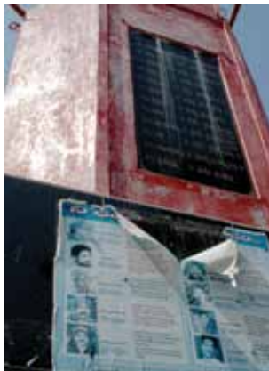
Fig.16 Zaffargarh monument.

said to reveal conflict at the very pores of so-called culture: the corpse of the martyr pits the state and the revolt as two autonomous and opposed sequences within the same mnemonic terrain. 18 When a memorial is inaugurated, relatives of the martyr mourn the deceased again, performing the mnemonic displacement materialized in the monument. Maoist commemoration ceremonies strongly follow customary funerary practice. Like traditional practices of remembrance, tribals and peasants sing and dance, only this time with Maoist-tinged lyrics of popular resistance, thus imbricating adivasi (aboriginal) and dalit (lower caste) culture organically into political movement. The Maoist movement thus effects something of a counter-interpellation —Louis Althusser’s expression is useful here—of the customary. Orators and artists from “front” organizations give eulogies, extolling the sacrifices of the martyrs, individuating through a life-narrative the proximal identification of the Maoist movement to everyday conflicts of power. The legendary Naxalite poet Gaddar will appear at each of these events. He has spent decades traveling around the countryside documenting local legends and song forms; to date, he has composed an extempore poem honoring each slain guerilla, a veritable hagiographic archive that is reported to have been gathered in twelve notebooks, a lyric chronicle of the insurgency.