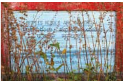
Fig.20 The Indravelli memorial, with inscribed plaque below. Note the shorter stake in photograph above: an aboriginal tribal totem.

The Indravelli monument stands in a cleared field one mile farther down the road from the market. The original monument was demolished by the government in the 1980s, only to be rebuilt in its current form in 1987, again by the aforementioned N. T. Rama Rao's party in a cynical effort to win votes in the tribal electorate. The Indravelli structure is the only one with a plaque in English and Hindi, two languages exotic to the dialects and languages spoken in this region: "Those mountains red, and the flowers red, and their death red, and our homage red." In a manner of speaking, these "global" languages