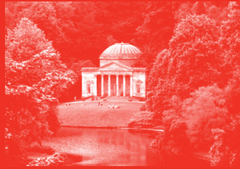
Fig.3 Henry Flitcroft, Pantheon, Stourhead, 1753-4. The Hoare family, 1740s onward.