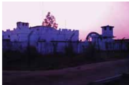
Fig.21 Indravelli police station.

Because of this watchful presence, the Indravelli monument is the least kept up of all the monuments that we have seen, its base and plaque set upon by weeds, a kind of censorship by horticulture, if you will. After photographing the monument, I indicate my interest in photographing the police station here as well. My companions strongly demur; these are kinds of things that invite extra-judicial lockup. Since no Americans or tourists venture this far, it's impossible for me to playact the wanderlust-driven ingenue. No alibi—no "global heritage" or "architectural interest"—here, I take a high-speed photograph through tinted car windows as we drive past in some haste.