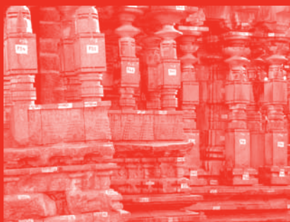
Fig.7 Thousand Pillar Temple, Kakatiya Empire, Hanumakonda, district Warangal, twelfth century.

At its best, the discipline of historiography is conscious of itself as a distancing one: of creating a speculative, categorical frame of reference through which nuggets of empirical or episodic meaning enter into a discursive, authoritative register. The historian's role is inevitably a cauterizing one, as French scholar Michel de Certeau terms it, "a partitive usage." The past is made accessible only after its definite "death," so to speak, is produced, rendering it as other. If the historian's production of knowledge has a certain place in power, it is a contra-purposive one, of imparting lessons about power while appearing to be cast out of power. "[Historiography's] discourse will be magisterial without being that of the master, in the same way that historians will be teaching lessons of government without knowing either its responsibilities or its risks. They reflect on the power that they lack." The turn to method, in this sense, is inevitably a self-abnegating one: "to the very degree that this discourse is rigorous, it will be destined for futility." 5 Only in this functional futility does historiography find its place of preeminence and sit next to the prince—a parasitical prominence, as it were—as narrative-producing handmaiden of the state.