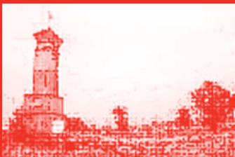
Fig.2 The memorial to PW martyrs at Indravelli. The original structure was inspired by Tiananmen Square.

Previous to this, the mainstream newspaper Indian Express , quite out of keeping with its pro-liberalization tilt, carried a sympathetic Sunday magazine article on the Maoists. 1 The article was accompanied by a picture of what it described as the memorial to “People's War martyrs” at Indravelli, the site of the police massacre and secret burial of some sixty Gond tribals who had assembled for a Maoist-organized meeting on April 20, 1981. The small, low-resolution image showed a square column on a pedestal, crowned by a pyramid-shaped capital. The structure, the article said, was inspired by the Monument to the People's Heroes (Renmin Yinxiong Jinian Bei) in Beijing's Tiananmen Square.