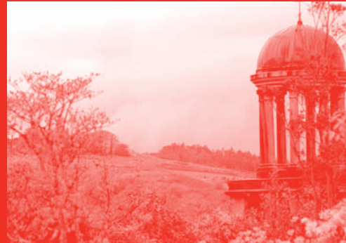
Fig.4 Bantry House, Cork, Ireland, 1765 onward.

My current research centers on the monuments of agrarian accumulation in the eighteenth century: the pleasure gardens, follies, and ha-has by which the Whig sensibility viewed the expansion of land under cultivation in Britain, America, and Bengal—the effect of Britain's “financial revolution”—through the devices of the aesthetic. Peering into the grainy image of the Indravelli monument, I was struck with an uncanny resemblance. The follies of Britain were “fakes” instantiating a political ideal; the rotundas, obelisks, Gothic temples of eighteenth-century English gardens were fragments of an exogenous, imagined, Virgilian culture, strewn around the landscape in order to ratify—to institute as the work of the imagination—a transformed political economy. Somewhat in the strain of French philosopher Quentin Meillassoux, I have called this kind of displaced memory—the recuperation of an archaic past that you cannot have had experienced as your own “history”—“ancestrality.” 2 The incongruous memory of Mao in the jungles of northern Andhra Pradesh, I thought, was perhaps a comparable kind of asserted ancestrality, something that could be useful to think through the critique of political economy that I was attempting to outline in my study of architecture. I decided to investigate.