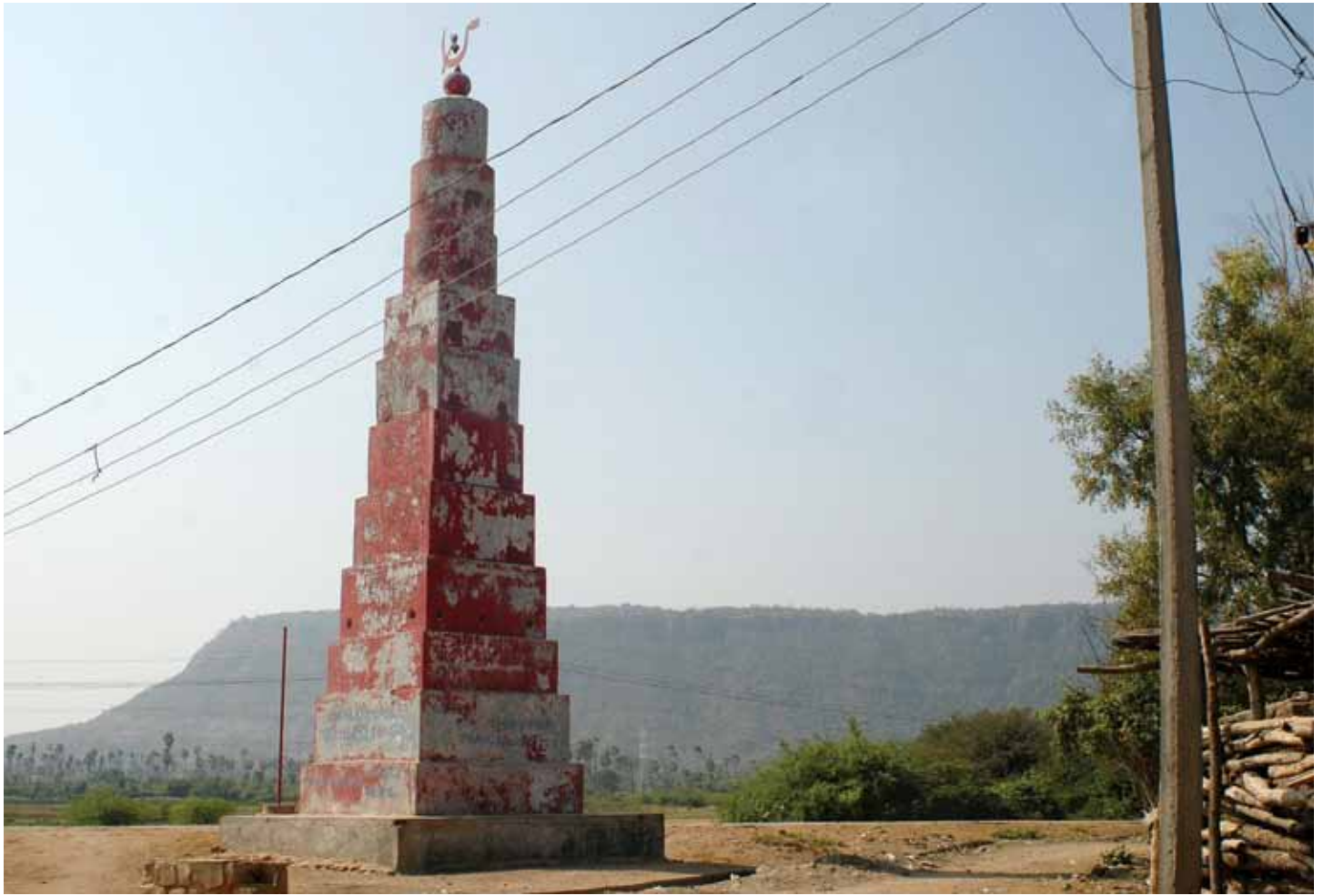
Fig.15 CPI (Maoist) "Martyr's Memorial" to cadre killed by police, Begumpet village, district Karimnagar, Andhra Pradesh.

heterotopia, point-irruptions of the geographic imagination that set varying texts of power to work, defined as much by the various actors of the agrarian scene as their ever-shifting modes of relation to different forms of politics. Monuments, tombs, tumuli are architecture's empty containers, pure parerga without content. Relieved of architecture's classical association with shelter, they are tasked to operate entirely as relief, as spatial protrusions and lapidary inscriptions that reveal space itself as something written, inscribed, mapped.