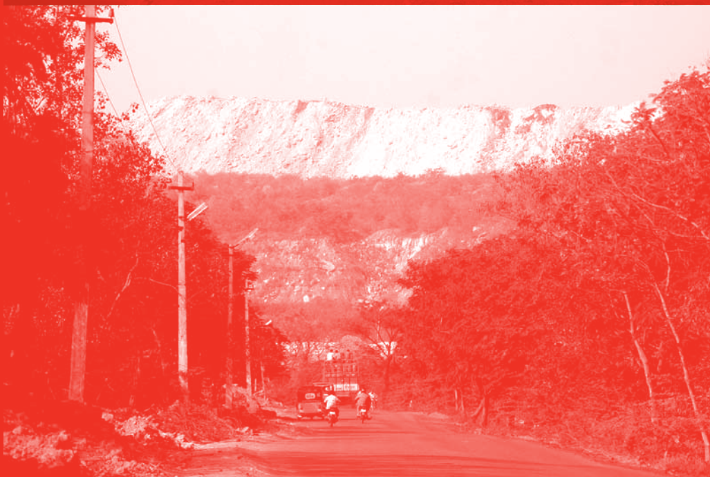
Fig.1 Strip mining.