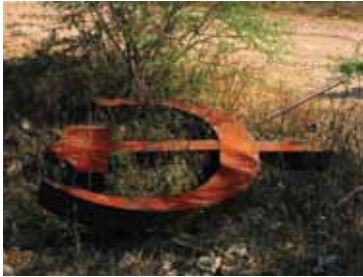
Fig.11 Fallen hammer and sickle from CPI (Maoist) "Martyr's Memorial," Husnabad. Dynamited by police in 2004.