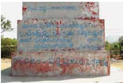
Fig.17 Begumpet village, Karimnagar. Police posters and writing on Maoist monuments, offering money and threats to Naxalites to surrender themselves.

The rituals enacted in front of these memorials draw on widely recognized folkloric traditions: elements of what Rao et al. have called “mnemo-history,” indigenous traditions of weaving empirical facts of history with mythic patterns of storytelling. In this sense, the funerary columns of the Naxalites derive as much from ancient tribal commemorative practices as the monumentalizing impress of “Asiatic Communism.” Thus the Maoist memorials not only form an index of the death of individuals and the commemoration of a collective struggle, but also mourn the demise of the autonomy of an entire civilizational rubric dating back to India’s prehistory, now increasingly hemmed in by the expropriative, modern descendants of the subcontinental powers.